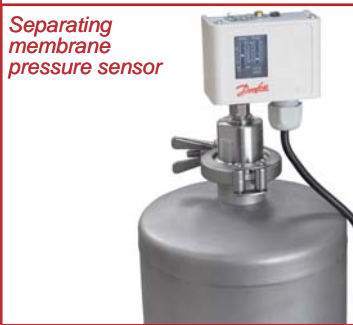
Separating membrane pressure sensor