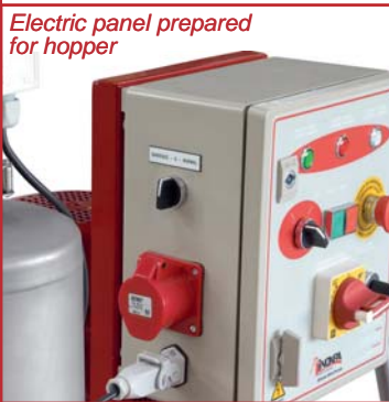
Electric panel prepared for hopper